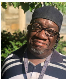
MR REGGIE Food Service